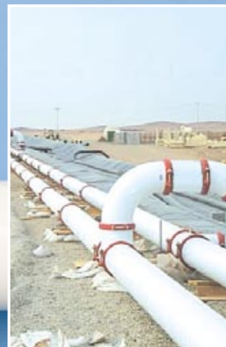
Alvenius thermo-plastic coated pipe system at the heap leaching plant at the Bulghah gold mine in Saudi Arabia.