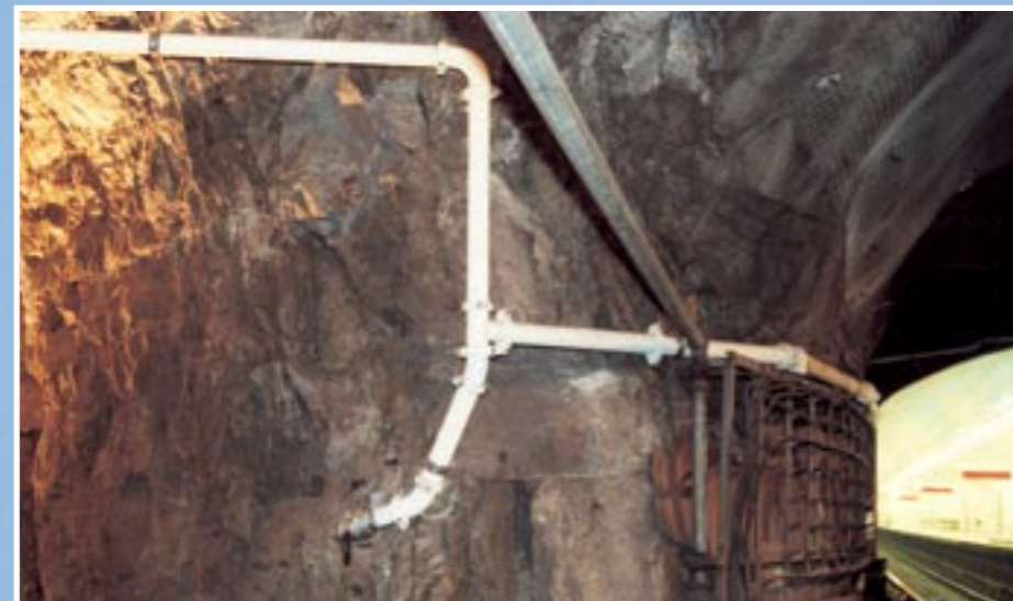
Stockholm Subway, chose the Alvenius thermo-plastic coated pipe system for fire hydrant pipes.