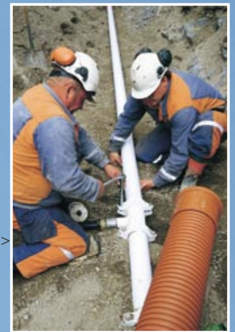
The city of Lidingö, Sweden, uses the Alvenius thermo-plastic coated pipe system for distribution of potable water. The pipe system complies with the requirements of the customer, regarding lifetime, flexibility and the water quality.

Pepsi-Cola Budapest. A first-class soft-drink requires pure water of highest quality. The pipe surface must under no circumstances affect the quality of the water. In order to maintain a high and even quality of the final product, Pepsi-Cola has chosen Alvenius thermo-plastic coated pipe system for the most critical section of the plant, i.e. the pipeline between the purification and the mixers.