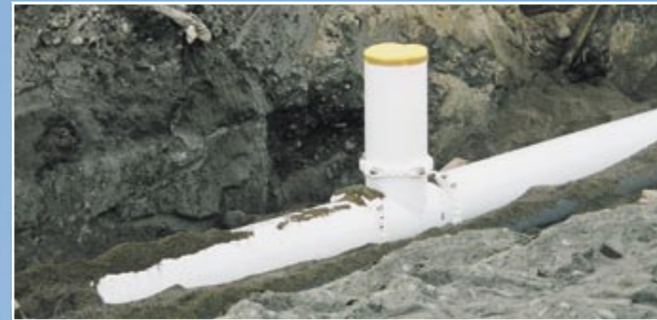
Stora Enso, Gruvön, Sweden chose Alvenius TP-pipes, as industrial sewage pipeline, for the new soda recovery boiler.

The thickness of film applied is 20-30 mil/500-700 microns.